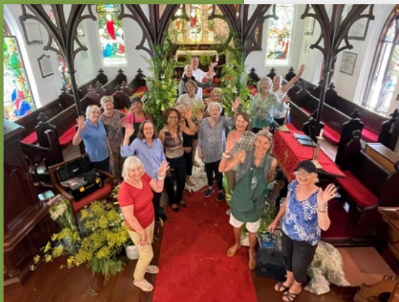
Flower Show arrangements were courtesy of the Bermuda Garden Club and Holy Trinity's home flower team.